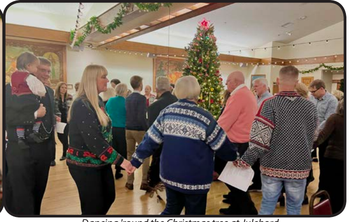
Dancing 'round the Christmas tree at Julebord