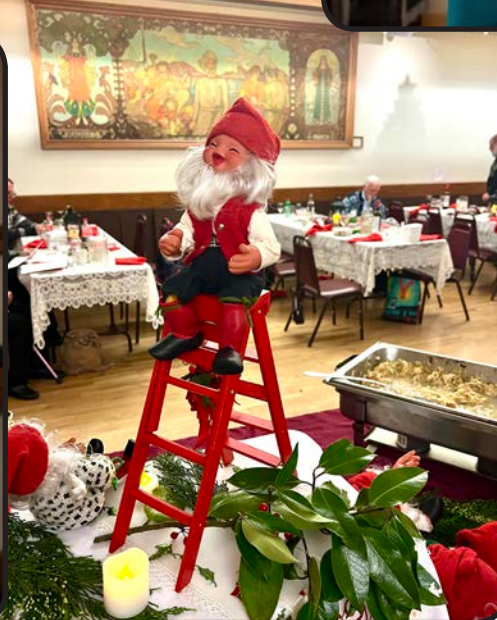
Everyone had a good time at Julebord