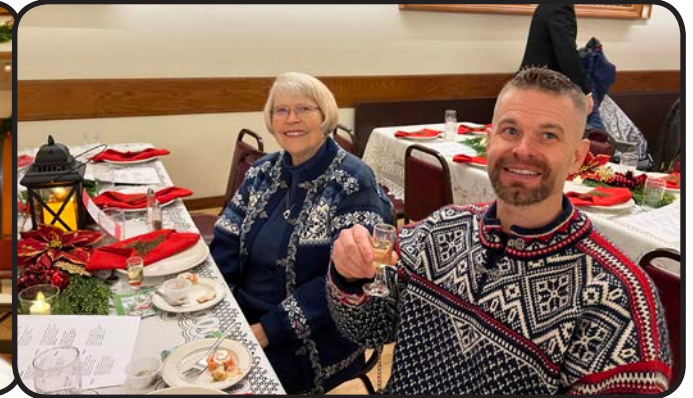
Skål to Julebord!