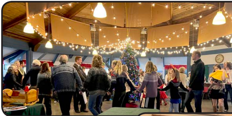
Norway Park Julebord 2022 dance