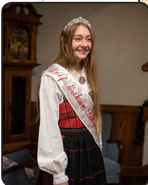
LEL Princess Freya