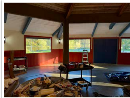
Currently, the interior of the Berg Pavilion is transforming into warmer Nordic colors.