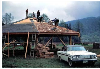
The initial construction of the Berg Pavilion in the late 1960s.